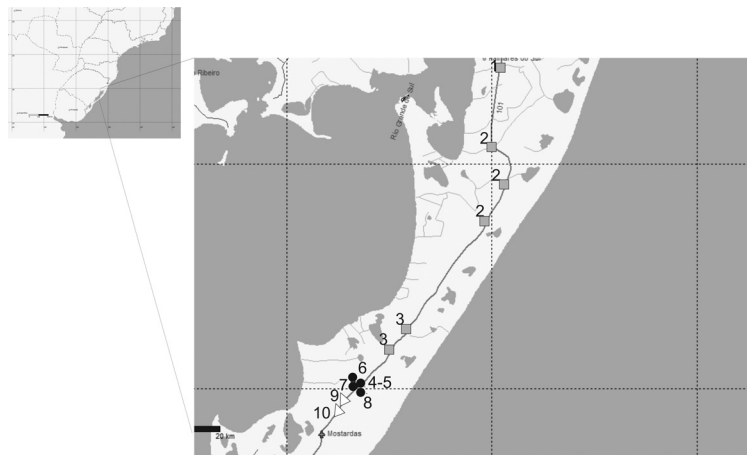
Figure 1 - Sampling sites of individual Ctenomys minutus from populations fixed for 2n = 48a (gray squares) or 2n = 42 (white triangles), both collected by Gava and Freitas (2003), and polymorphic populations 2n = 42-46 (black circles), collected for this study from a contact zone on the coastal plain of southern Brazil. Abbreviations for sampling locations are shown in Table 1.

We collected tissue and blood samples from 50 individuals on a gradient consisting of four different localities in the contact region between the chromosomal races 2n = and 2n = 48a (Figure 1; coordinates 30^{\circ}59'S and 50^{\circ}49'W ), in order to determine diploid number and microsatellite variation. A complete map with details on the