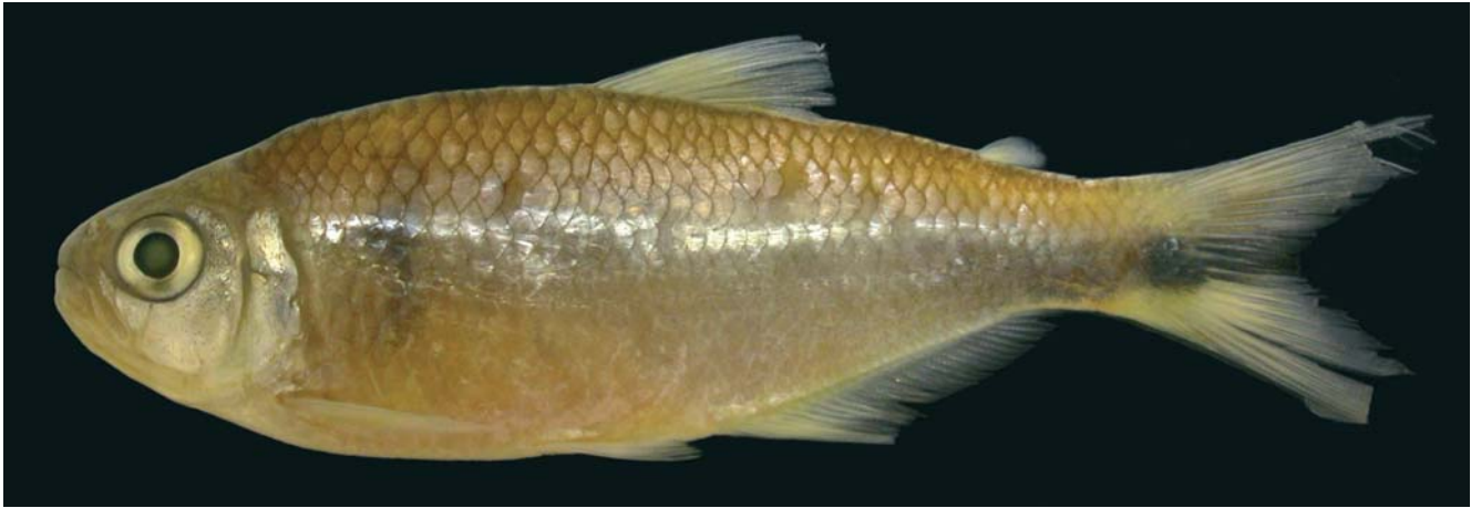
Fig. 2. Hemibrycon divisorensis , MCP 41346, paratype, female, 81.6 mm SL; río Ucayali drainage, Loreto, Peru.

the scale row bearing the lateral line to the scales near anal-fin base and ventral margin of caudal peduncle. Wide and asymmetric black spot covering base of middle caudal-fin rays and extending along entire length of caudal-fin rays 9 to 12-13. Dorsal and caudal fin with dark pigmentation diffuse. Anal fin with small black chromatophores along its border forming narrow stripe. Other fins without distinctive marks (Figs. 1-2).