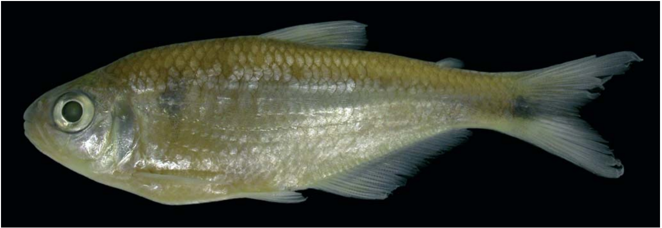
Fig. 1. Hemibrycon divisorensis , MUSM 28860, holotype, male, 68.2 mm SL; río Ucayali drainage, Loreto, Peru.

Snout rounded from margin of upper lip to vertical through anterior nostrils. Head small. Mouth terminal, mouth slit nearly at horizontal through middle of eye. Maxilla long, slightly curved, and aligned at angle of approximately 60 degrees to longitudinal body axis, with ventral border slightly convex to nearly straight and dorsal border slightly concave.