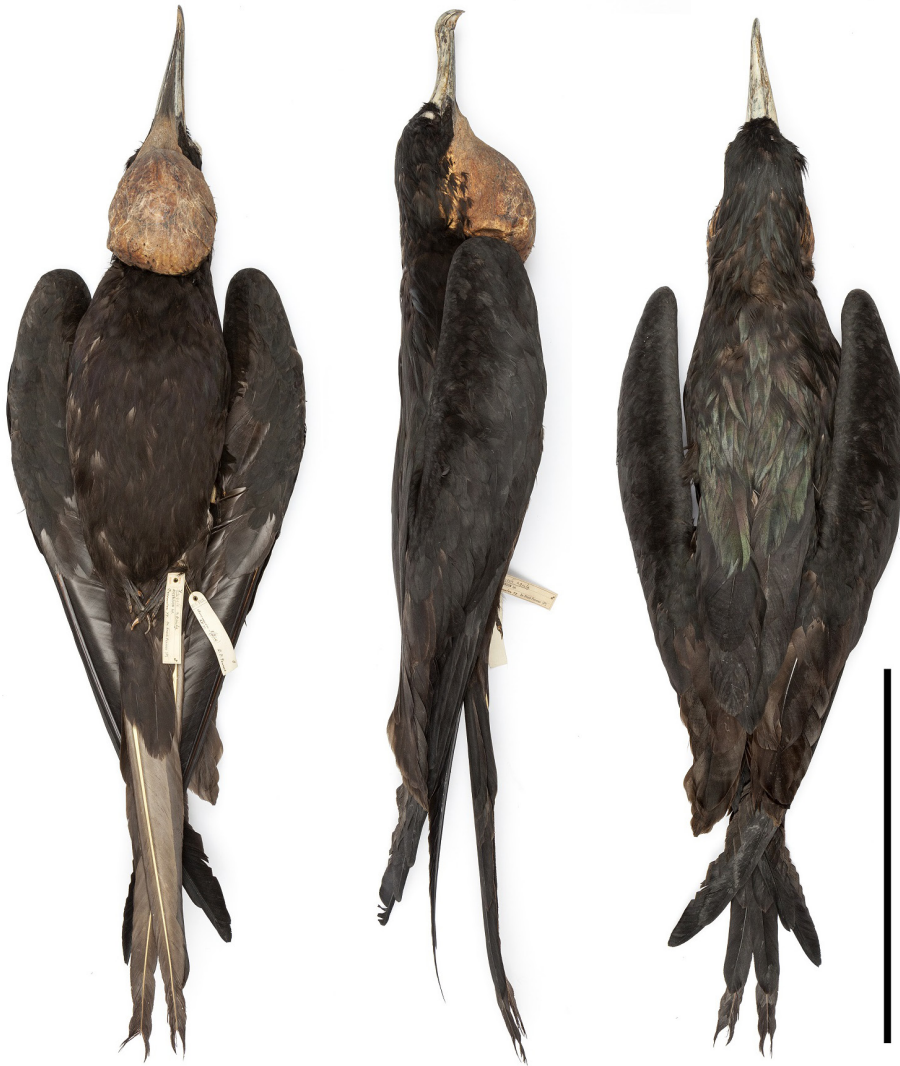
Figure 3. Neotype of Fregata aquila (Linnaeus, 1758): Ventral, lateral, and dorsal views of specimen BMNH 1899.1.4.13 in the Natural History Museum at Tring, UK. Scale bar: 30 cm.

1999) by clarifying taxonomic identity and type locality of the Ascension Island frigatebird (Article 75.3.1); nominating its size and green gloss on dorsum and upper-wing coverts as diagnostic characters (Article 75.3.2); providing data and description sufficient to ensure recognition of the specimen designated (Article 75.3.3); giving reasons and references for believing that original type material is lost (Article 75.3.4); selecting a neotype consistent with descriptions of at least some of the former syntypic material (Article 75.3.5); choosing a neotype from the most specific of the originally cited type localities, Ascension Island (Article 75.3.6); and recording that the neotype is the property of a recognized scientific institution (Article 75.3.7)