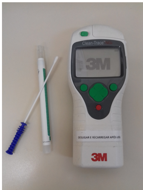
Figure 1: NGI Luminometer Clean-Trace ATP Surface Test, manufactured by 3M Health Care in St.Paul, Minnesota, USA and swabs in Wales, United Kingdom.

A value of 100 RLU was used as the cutoff point according to the parameters of the Hospital Infection Control Committee (CCIH) to consider a clean surface.